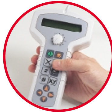
Remote control for engraving functions

INTELLIGENT SYSTEM IS6000 INTELLIGENT SYSTEM IS7000 INTELLIGENT SYSTEM IS8000