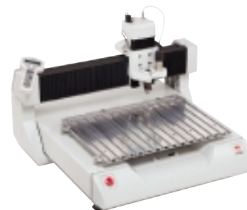
IS6000 version : 610 x 410 mm