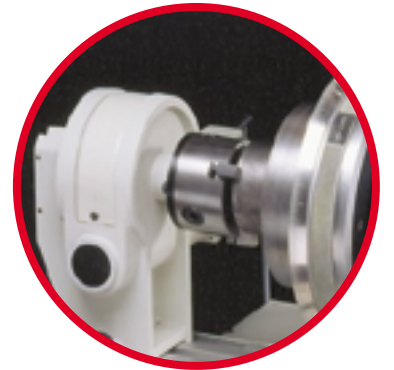
Optional Ø 120mm cylinder attachment