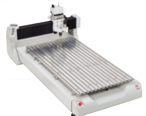
IS8000 version : 610 x 1220 mm