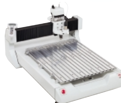
IS7000 version : 610 x 815 mm