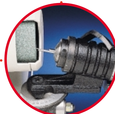
"T" index for truncature